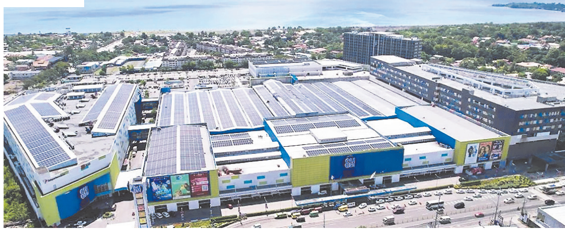
SM CITY DAVAO