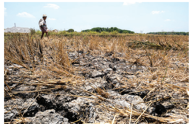
A FARMER walks across a rice field under the scorching sun in Brgy. Sabang, Naic, Cavite.