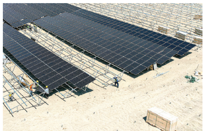
A SOLAR power facility is seen in Currimaog, Ilocos Norte, May 5.