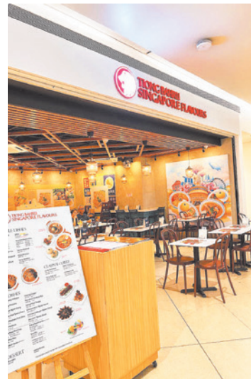
THE GATEWAY MALL 2 branch in Cubao, Quezon City.

"Our journey reflects more than expansion — it's a testament to resilience and passion. Even during the pandemic, we