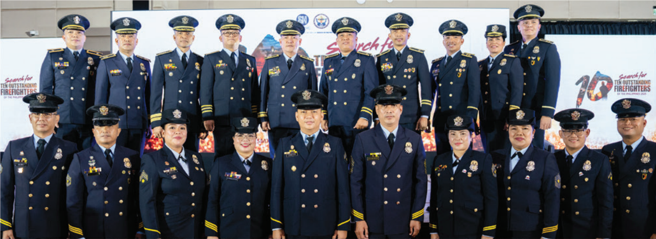
The 20 finalists of the 2025 Search for the Ten Outstanding Firefighters of the Philippines represent the country's 38,000 firefighters nationwide.