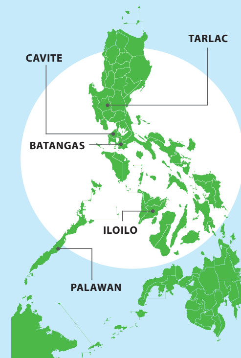
Areas where Megaworld's new carbon forests will be located

1,000+ HECTARES Coverage of carbon forests MEG will activate in the next few years