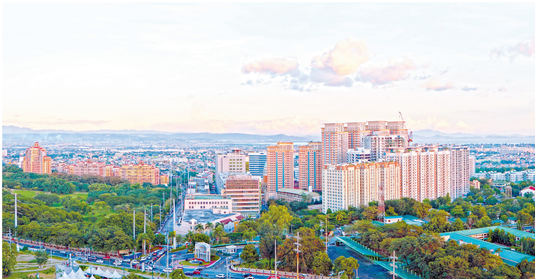
The 50-hectare McKinley Hill in Taguig hosts several Megaworld-owned developments that form part of the 52 carbon-neutral developments under the company's portfolio, including Venice Grand Canal Mall and the Commerce and Industry Plaza office tower.