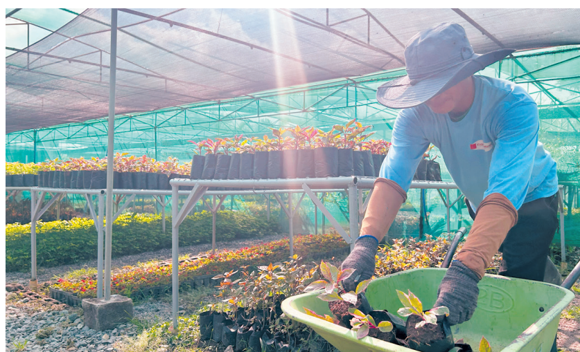
Megaworld grows its own shrubs, trees, and flowering plants in its plant nurseries located in various areas across the country, including this one in Tanza, Cavite.

Since 2021, Megaworld has already planted around 100,000 trees inside its dedicated carbon forests across the country. The company also supported