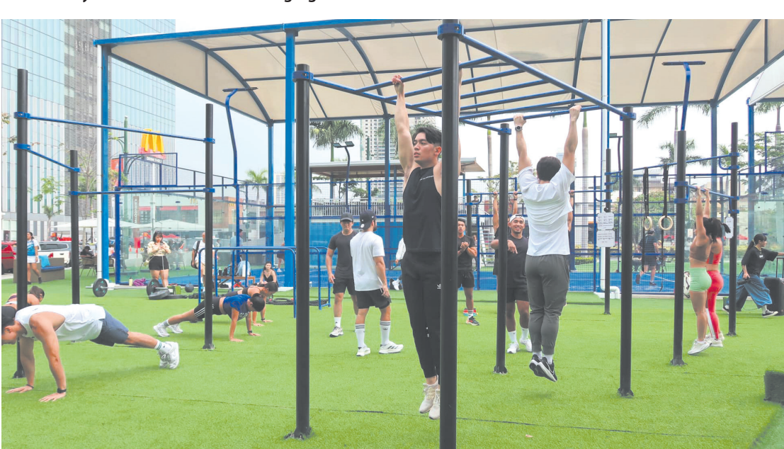
Manila Padel Club has become a go-to destination for urban dwellers wanting to enjoy fit and active lifestyles in ArcoVia City.