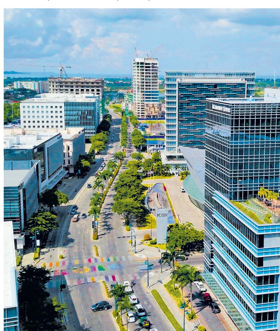
Iloilo Business Park hosts an array of business and investment opportunities for those wanting to bring or expand their businesses in Western Visayas.