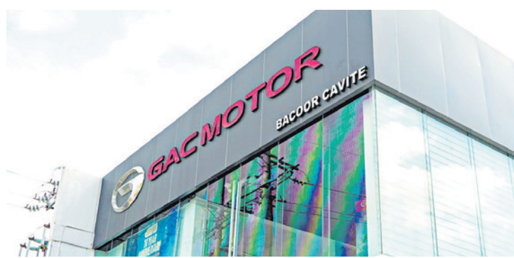
GAC MOTOR PHILIPPINES