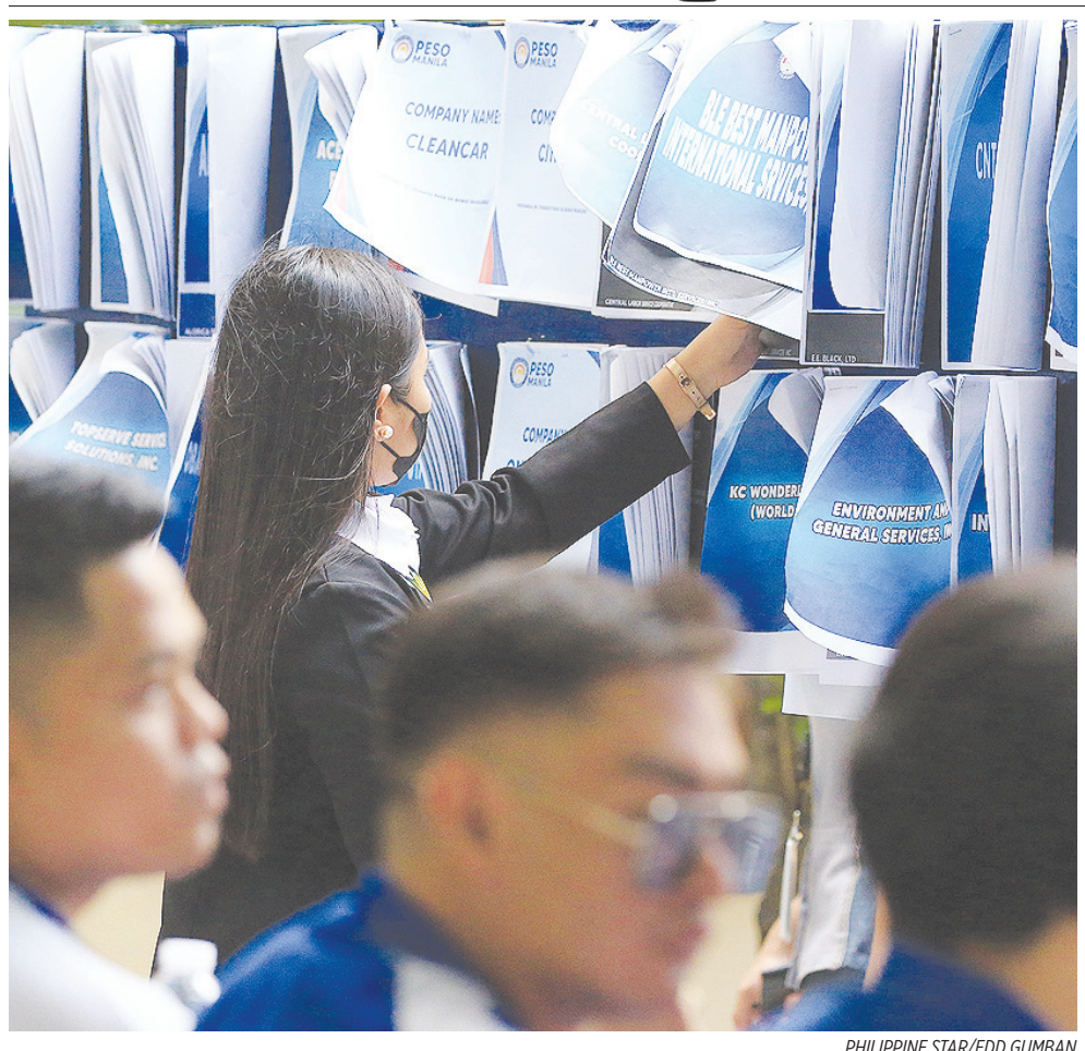
JOB SEEKERS attend the mega job fair organized by the Public Employment Service Office at the Universidad de Manila (UDM) covered court.

"We've always known deep inside that there was something there, and we could really use technology for good," he added.