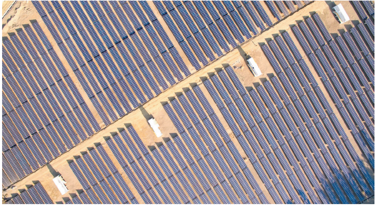
THE 68-MW "Garcia 2" Solar Project, located in the municipality of Currimao in Ilocos Norte.