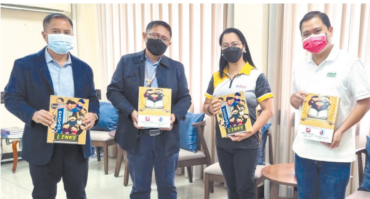
Ceremonial turnover of the printed modules for the implementation of the Bulig-Basa project

To ensure the attainment of its aspirations for the communities, MGen-GBP anchored its social development programs on One Meralco Group's sustainability agenda of Powering the Good Life, particularly under the Prosperity pillar. This pillar aims to bring lasting impact to its host communities and ultimately, uplift the quality of their lives.