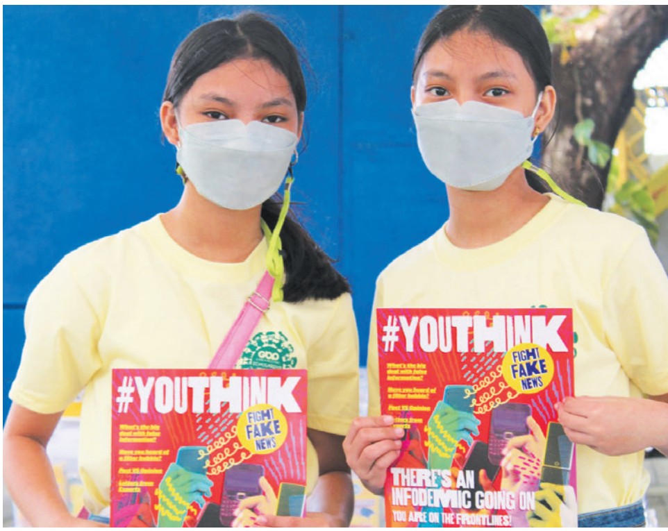
GBP scholars showing the books they've received, authored by CANVAS