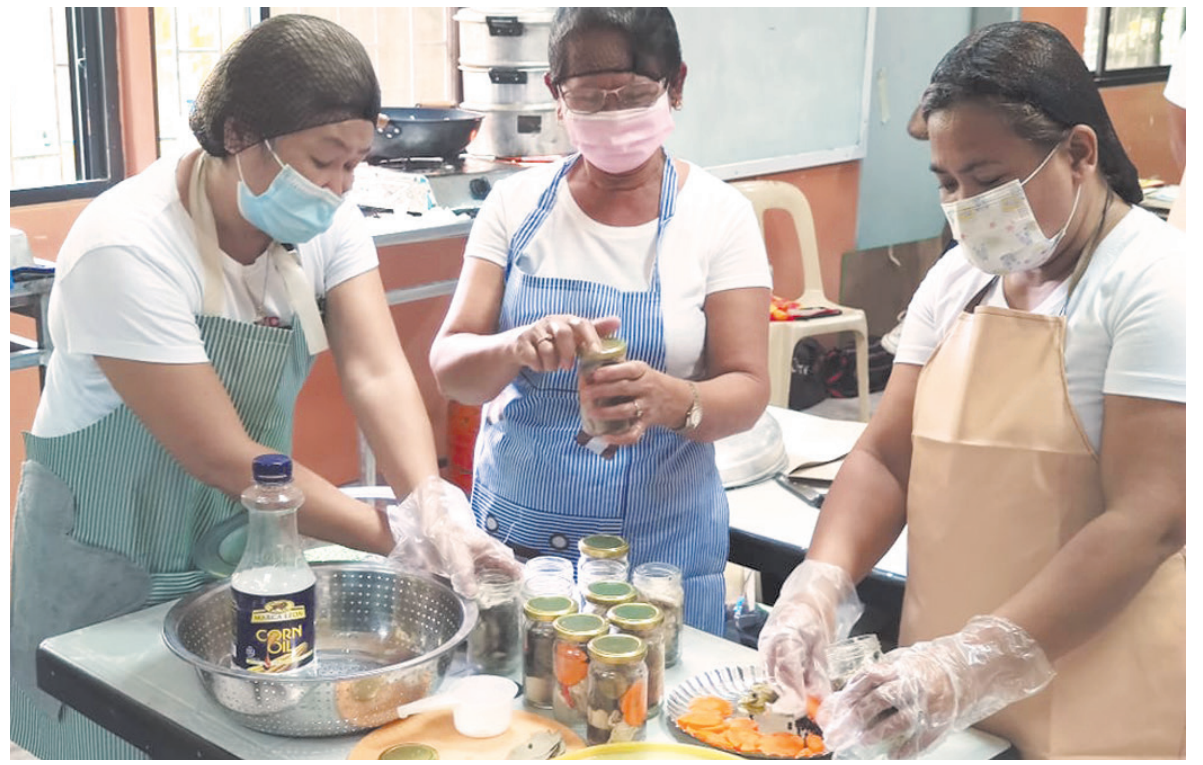
Members of Atimonan Coastal Food Producers Cooperative preparing Aplaya Spanish Sardines