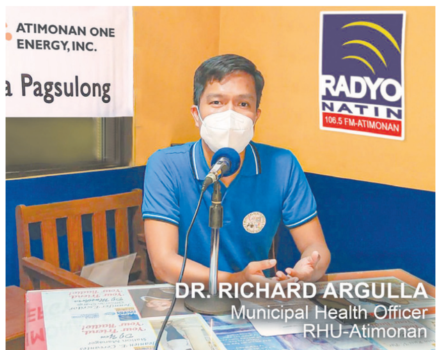
Kaisa Sa Kalusugan Radio Health Program