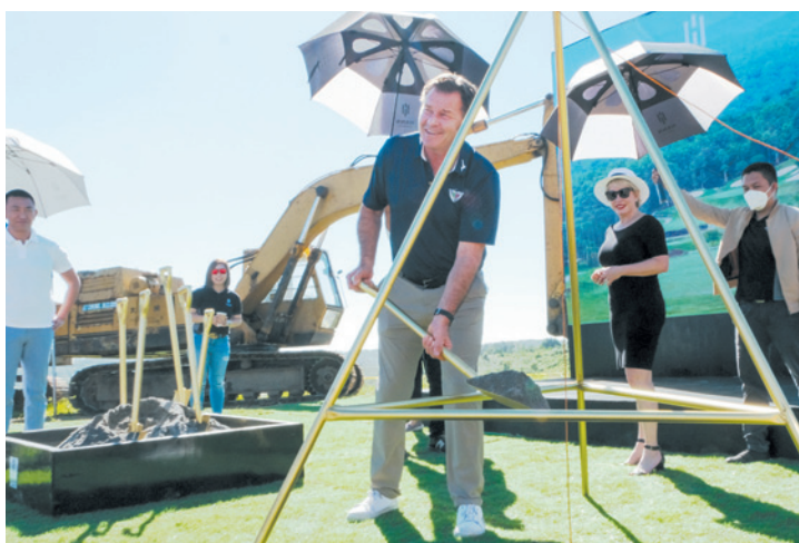
Golf legend Nick Faldo doing the ceremonial shoveling for the Hann Reserve groundbreaking at New Clark City, Tarlac

Hann Philippines, Inc. is a member of Hann Group (formerly known as Widus Group).