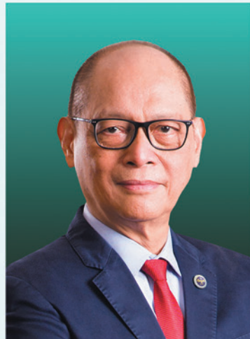
BENJAMIN E. DIOKNO Secretary Department of Finance

Sustaining Recovery through Mounting Risks