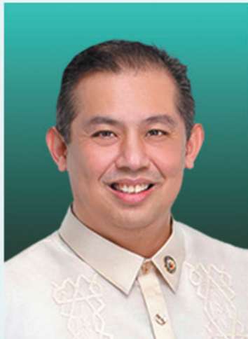
FERDINAND MARTIN G. ROMUALDEZ Speaker House of Representatives of the Philippines

Reform Road to 2025: Key Legislative Measures to Boost Philippine Businesses