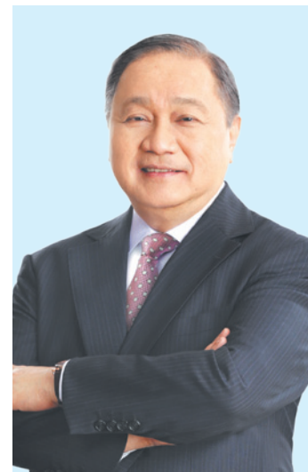
MPH Chairman Manuel V. Pangilinan