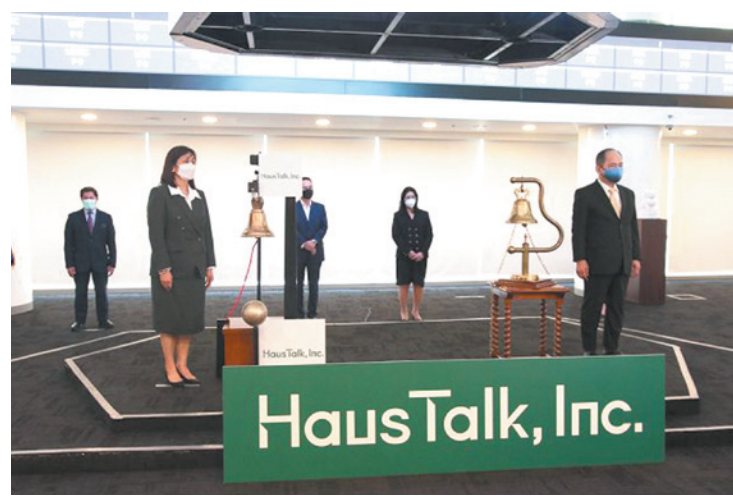
THE corporation decided to refocus its resources and cancel the projects in Calasiao, Pangasinan and Sta. Rosa, Laguna, and recognized the potential of the Biñan project.

Slated to be launched by November this year, the Biñan project will have 1,400 units in a 12-hectare development. A company official previously told BusinessWorld that it was expecting P3.8 billion in revenues from the mixed-use project development.