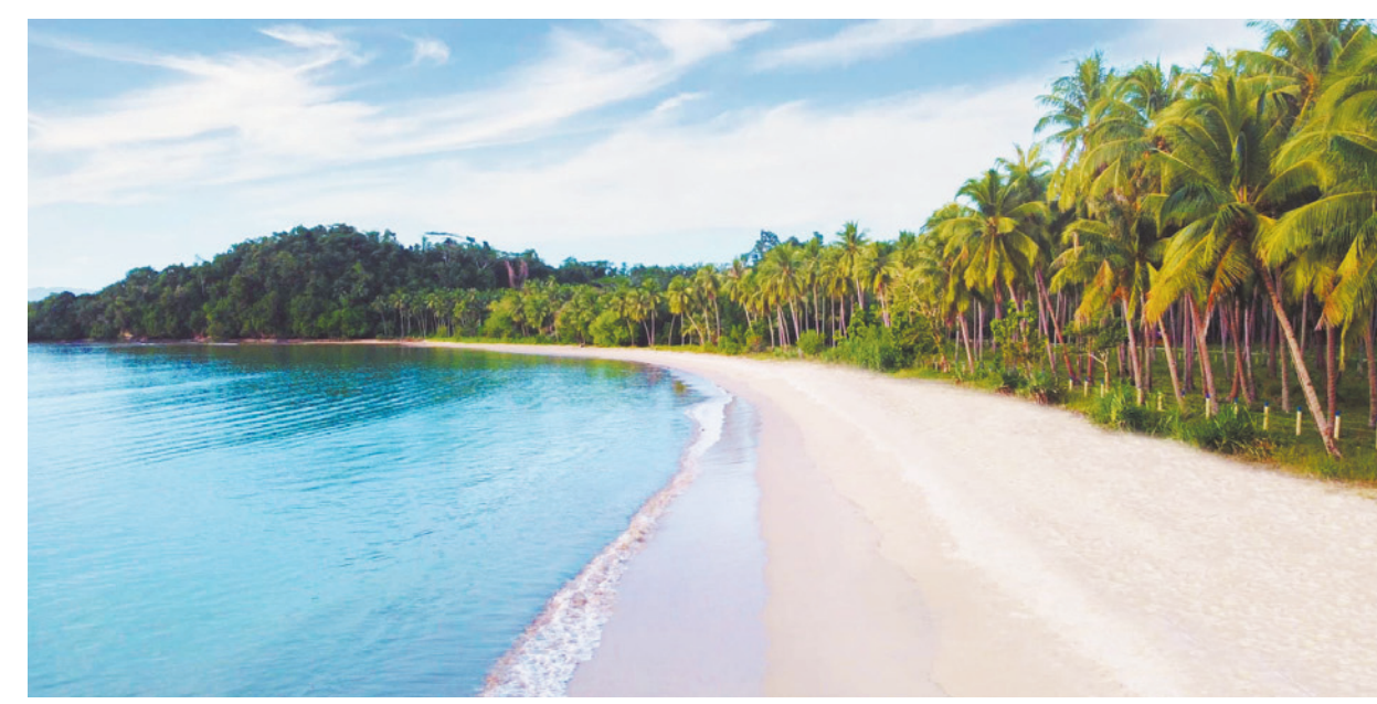
Attracting tourists from various parts of the country and the world, San Vicente's famous Long Beach Area can easily rival the best beach locations in Southeast Asia.