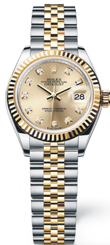
OYSTER PERPETUAL LADY-DATEJUST