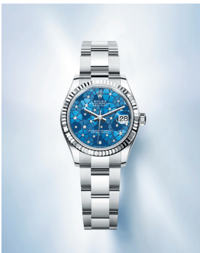
Perpetual Calibre 2236