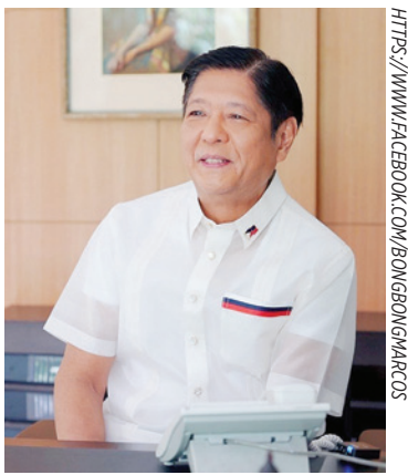
PRESIDENT-ELECT Ferdinand R. Marcos, Jr.