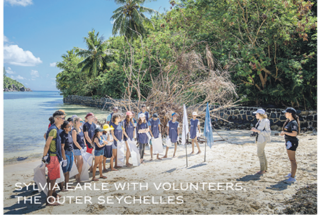
SYLVIA EARLE WITH VOLUNTEERS, THE OUTER SEYCHELLES