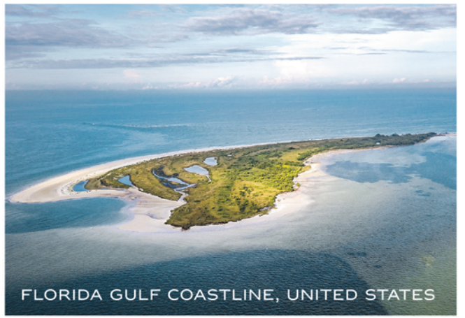
FLORIDA GULF COASTLINE, UNITED STATES