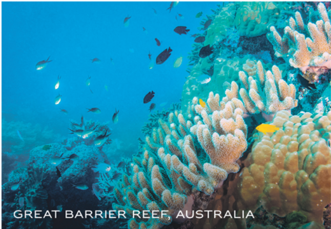
GREAT BARRIER REEF, AUSTRALIA