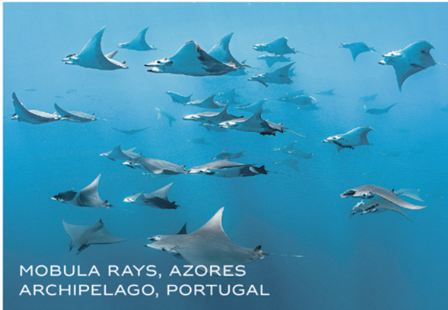
MOBULA RAYS, AZORES ARCHIPELAGO, PORTUGAL