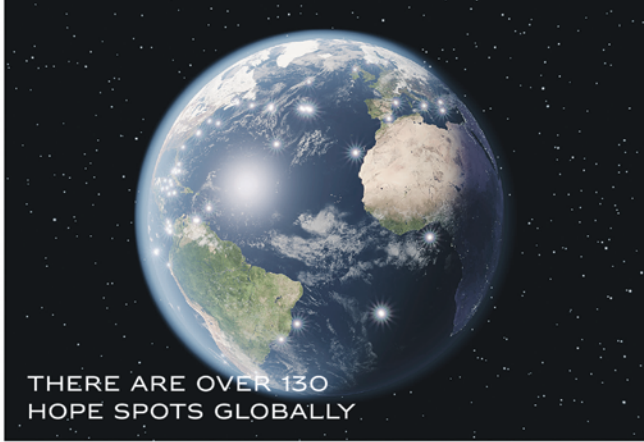
THERE ARE OVER 130 HOPE SPOTS GLOBALLY