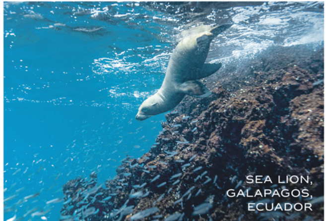
SEA LION, GALAPAGOS, ECUADOR