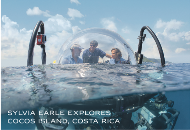
SYLVIA EARLE EXPLORES COCOS ISLAND, COSTA RICA