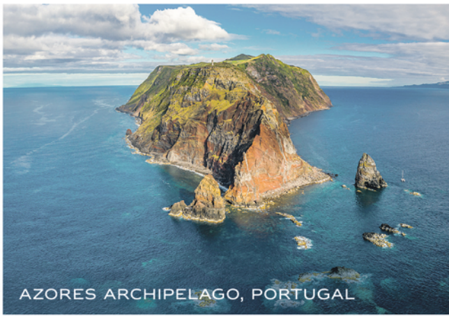
AZORES ARCHIPELAGO, PORTUGAL